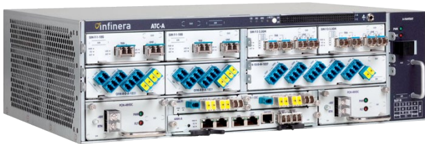
ATN Latency-Optimized DWDM Solution